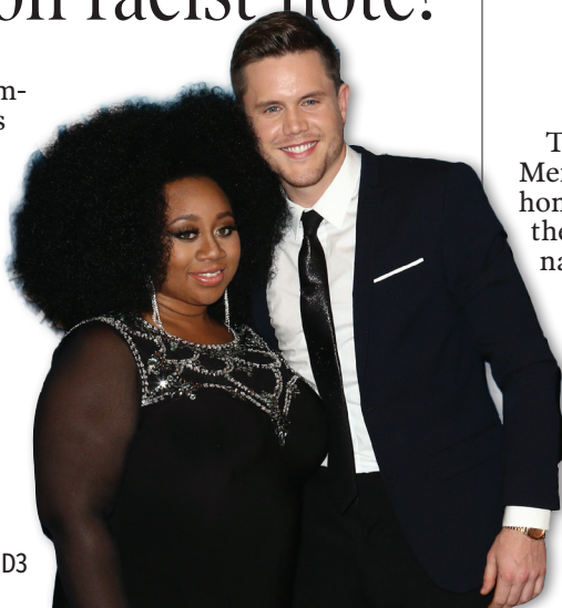
Please see 'IDOL' on Page D3

To be clear: Though it passed over Jennifer Hudson, "American Idol" has idol-ized people of color. The list of winners includes Ruben Studdard