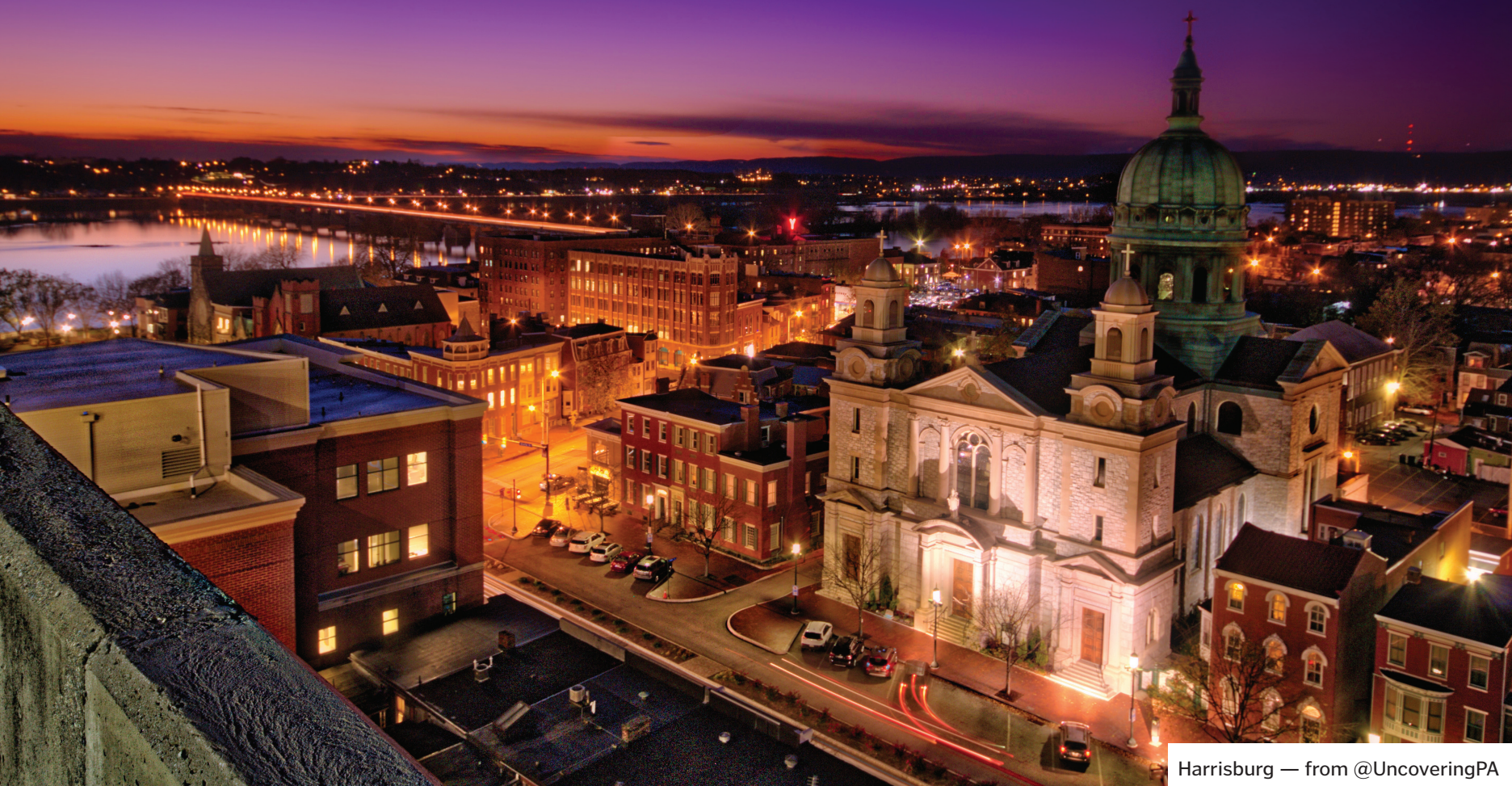
Harrisburg