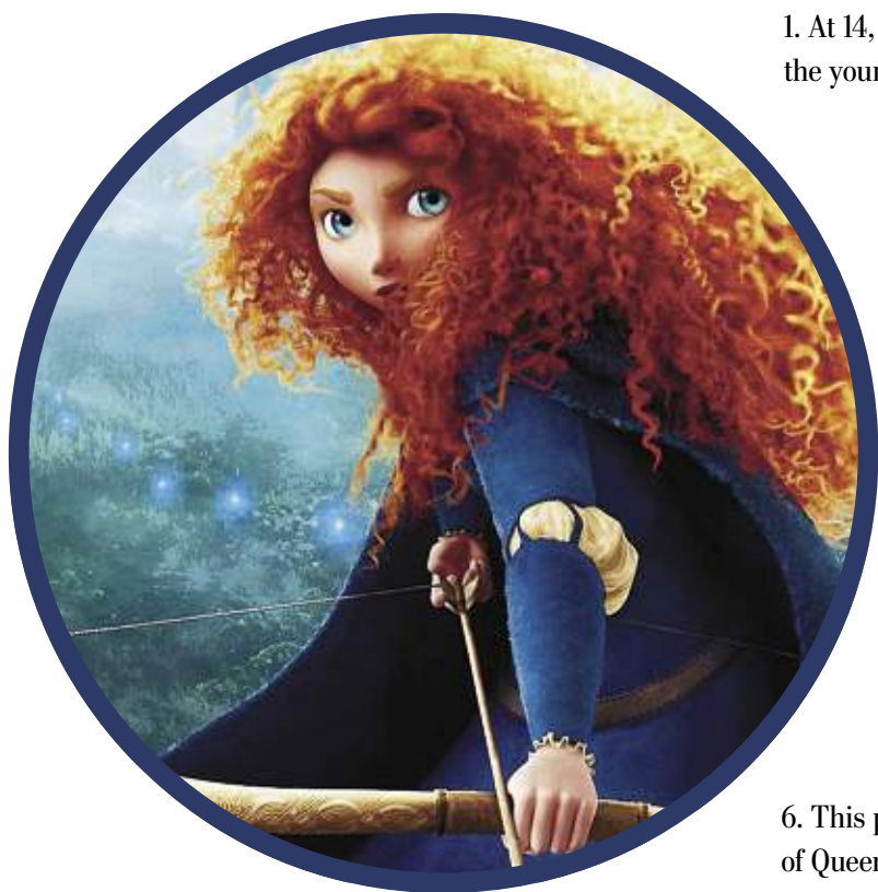
Princess Merida, "Brave"

Did you know that Cinderella has strawberry-blond hair? Or that Beauty and the Beast is set in winter? How about that Prince Phillip is the first prince to use weapons against a villain? Some of the most beloved Disney princes and princesses will be on stage during the Disney on Ice show at the Giant Center in Hershey. See how much you know about the Disney princesses and princes by matching them to the correct description: