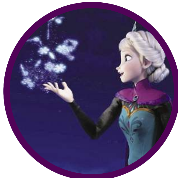
Elsa the Snow Queen, "Frozen"