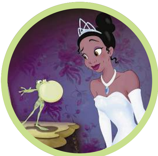
Princess Tiana, "The Princess and the Frog"