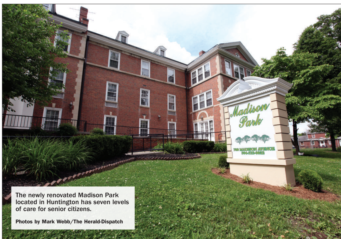
The newly renovated Madison Park located in Huntington has seven levels of care for senior citizens.