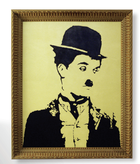
CHARLIE CHAPLIN: This screen print might not be old, but it definitely has a vintage feel. $199. Grey Beards Antiques .