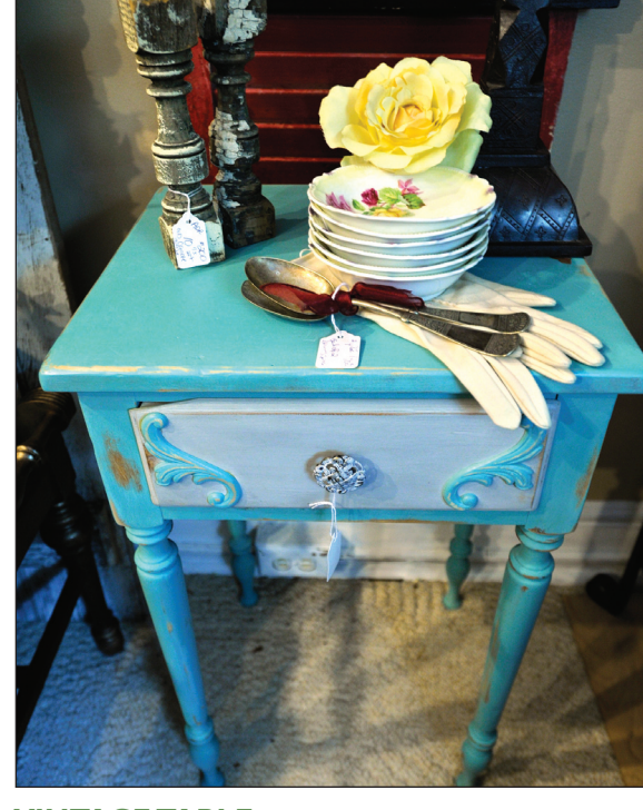
VINTAGE TABLE: With multipurpose uses, this could double as an end table or a night stand. The bright blue gives it a unique flair. $45. Grey Beards Antiques .

GREEN GLASS: This beautiful large and heavy-pressed canister/jar looks like an LE Smith design likely to be out of the