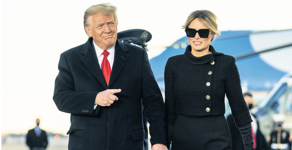
TRUMP LEAVES WHITE HOUSE

- American poet Amanda Gorman, during the Presidential Inauguration